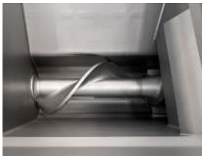
Top view of infeed hopper. Please note the sharp knife edges of grinding worm/auger designed to grab and feed the frozen blocks.

Here shown fed by the scanLift SC 350 with 220 L trolley.