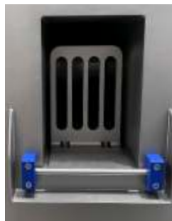
Hygienic zone shown in running position (closed) and in cleaning/inspection position. When opened, the grinder cannot be started until the guard has been positioned in closed position.